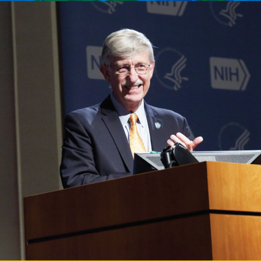
Dr. Francis Collins, NIH Director, described the unique and important partnership between the NIH Clinical Center and The Inn.